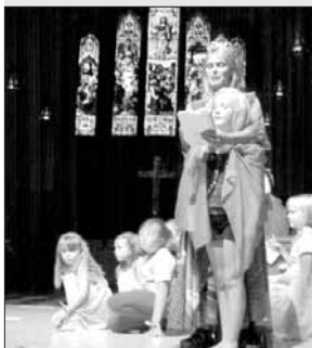
The Savage God Performance Ensemble has been a resident partner since 1999.

Stage Risers = $40.00 each (accommodates 16 persons per riser)