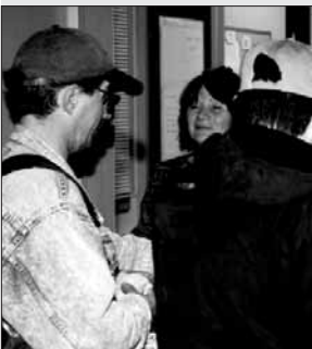
The Sandwich Project is part of Christ Church Cathedral's outreach to the greater community.