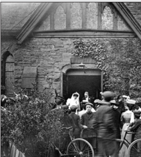
A Christ Church wedding, circa 1908.

Christ Church Anglican Cathedral is an inclusive community of disciples of Jesus Christ serving God in downtown Vancouver through worship, ministry and for outreach to near and far. The Cathedral is enriched and enlivened by the diversity of its community. It is a place where faith is nurtured and all age groups are welcomed. The performing and visual arts find a home here. This is a safe, welcoming and positive space for GLBT people, their friends and families.