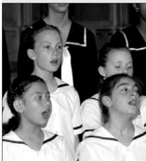
The Vancouver Children's Choir, has been a choir "in residence" since 1986.

Flip Charts are free with room bookings, subject to availability.